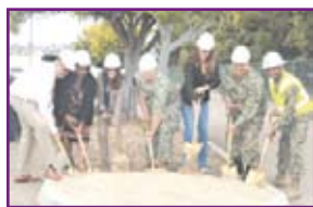
Groundbreaking for Child Development Center at Naval Base Point Loma May 10, 2024.

Naval Base Point Loma continues construction of a new 35,987-square-foot Child Development Center (CDC) to provide quality childcare services for military personnel and authorized civilians.