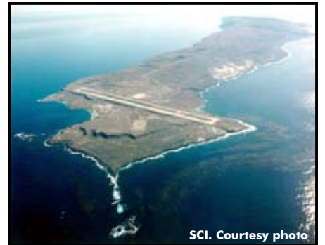
SCI.

Scoping comments may be submitted via the project website or by mail to: Naval Facilities Engineering Systems Command Southwest, ATTN: SCITT EIS Project Manager, 750 Pacific Highway, Floor 12, San Diego, CA 92132-0058.