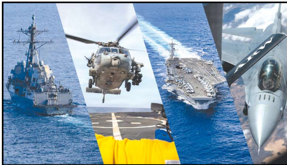
Project Freedom in Strait of Hormuz.

“Our support for this defensive mission is essential to regional security and the global economy as we also maintain the naval blockade,” said Adm.