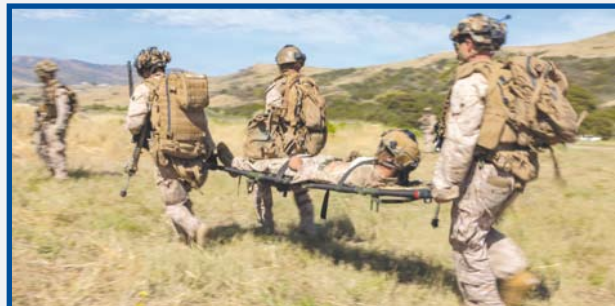
CAMP PENDLETON (April 29, 2026) Marines assigned to Battalion Landing Team 2/4, 13th Marine Expeditionary Unit, evacuate a simulated casualty to the landing zone during a vertical assault raid here. The execution of this raid is a key event of the amphibious raid course that tests BLT 2/4's and Marine Medium Tiltrotor Squadron 364 (Rein.)'s proficiency in complex raid-force tactics and enhances the 13th MEU's operational capabilities.