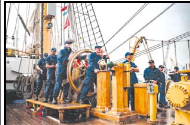
PORTSMOUTH, N.H. (July 29, 2024) Coast Guard Academy Cadets man the helm of Coast Guard Cutter Eagle (WIX 327) as they depart from here. Eagle serves as a training ship for all cadets at the Academy, helping to build a love for the sea and its lore.