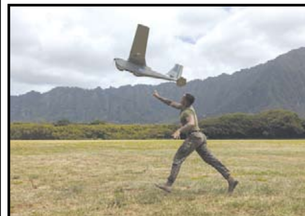
WAIMANALO, HAWAII (July 15, 2024) A U.S. Marine assigned to the 15th Marine Expeditionary Unit launches an RQ-20B Puma small unmanned aerial system at Marine Corps Training Area here. The sensor training challenged the Marines to integrate multiple sensing systems into a singular interface, simplifying data collection for analysts.