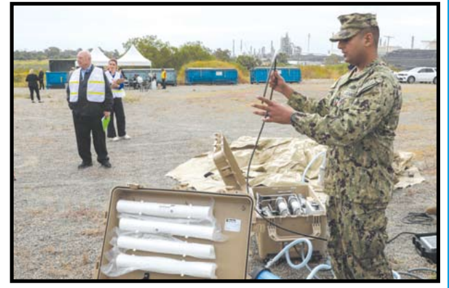
WATER SYSTEM Navy Seabees from Amphibious Construction Battalion 1 demonstrate a portable water purification system as part of a Defense Support of Civil Authorities exercise during Los Angeles Fleet Week May 22, 2024.