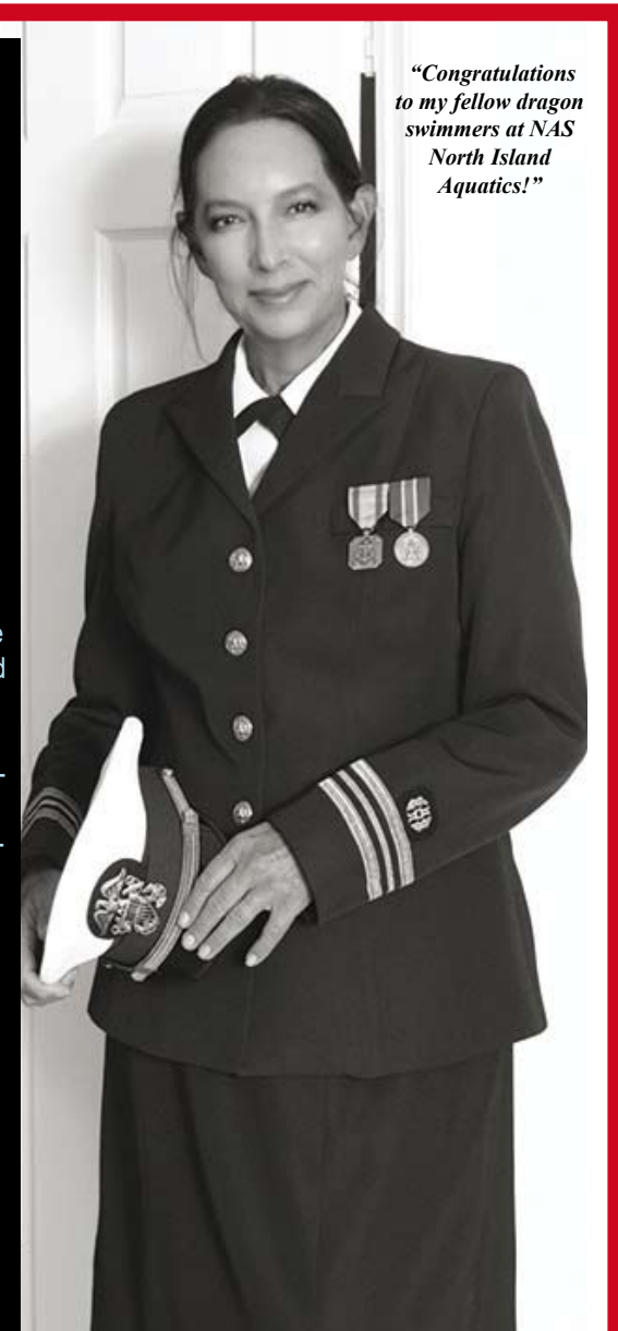
"Congratulations to my fellow dragon swimmers at NAS North Island Aquatics!"