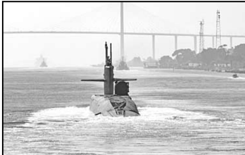
An Ohio-class submarine approaches the Mubarak Peace Bridge while transiting the Suez Canal, Nov. 5, 2023. The boat is deployed to the U.S. 5th Fleet area of operations to help support maritime security and stability in the Middle East region.

The sea-launched cruise missile, nuclear, or SLCM-N, can be launched from surface ships and also attack subs, rather than from traditional ballistic missile submarines. Wolfe told