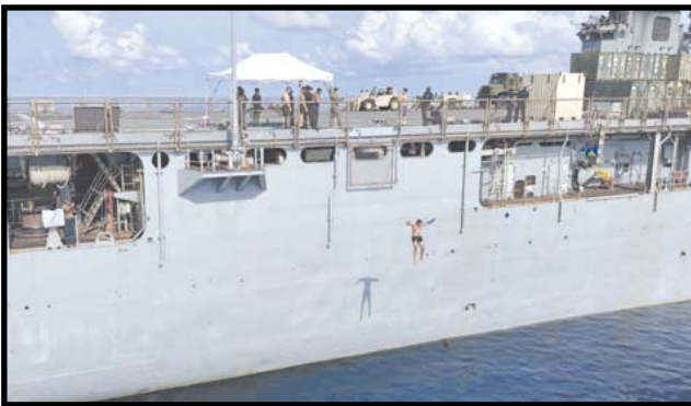
SWIM CALL A Marine from 15th Marine Expeditionary Unit jumps off the flight deck of amphibious dock landing ship Harpers Ferry during a swim call in the Sulu Sea, May 22, 2024.