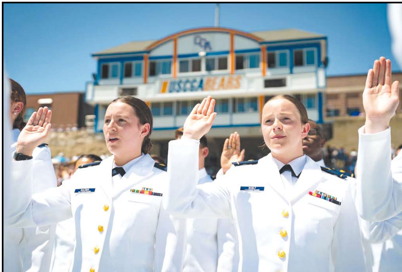
GRADUATION DAY Cadets take the oath of office during commencement at the Coast Guard Academy in New London, Conn., May 22, 2024. The Coast Guard Academy commissioned 225 new officers.

Serving active duty and retired military personnel, veterans and civil service employees