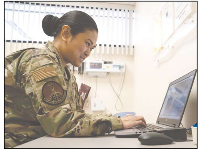
Virtual group therapy—gathering regularly online with fellow group members to discuss mental health challenges—is an effective, and convenient, alternative to in-person group therapy or even one-on-one therapy.

Targeted Care standardizes the patient intake and evaluation process and ensures the patient gets the specific care he or she needs in a timely manner, whether it’s an individual appointment, group therapy, nonclinical support, or specialty mental health treatment, such as medications or inpatient services.